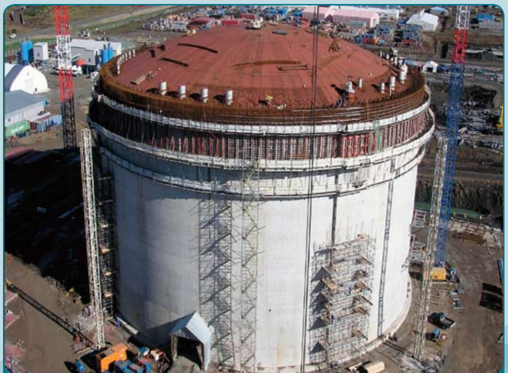
Huge LNG tanks like this will hold gas from the Pluto field.